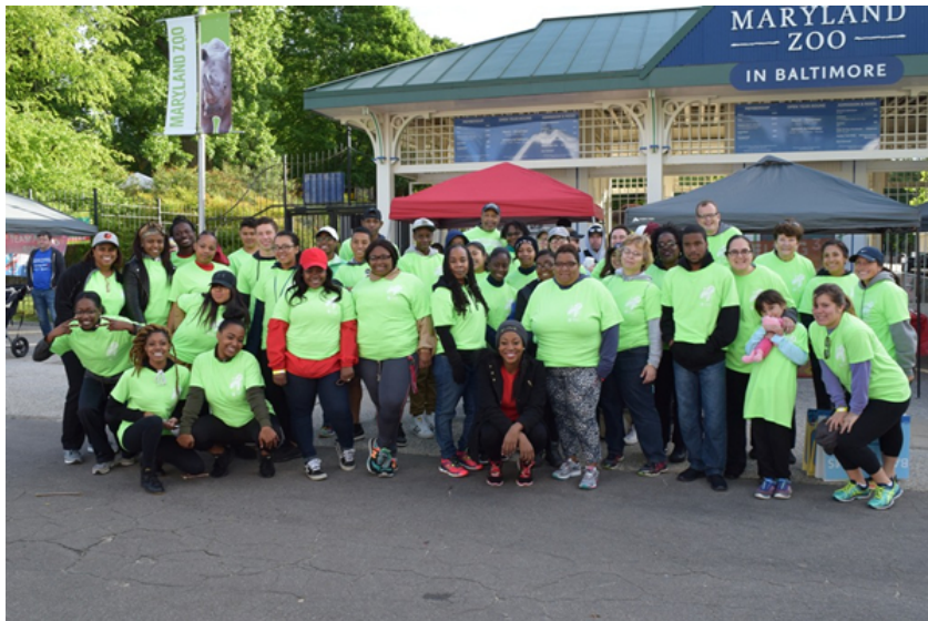
Volunteers gather for the 2017 AIDS Walk & Run Baltimore.

Some 600 attendees including volunteers participated in the annual AIDS Walk & Run Baltimore at The Maryland Zoo in Baltimore on May 7. The event raised nearly $100,000 to support Chase Brexton Health Care's HIV/AIDS outreach and infectious disease and case management services, which provide critical HIV/AIDS care and prevention in Baltimore.